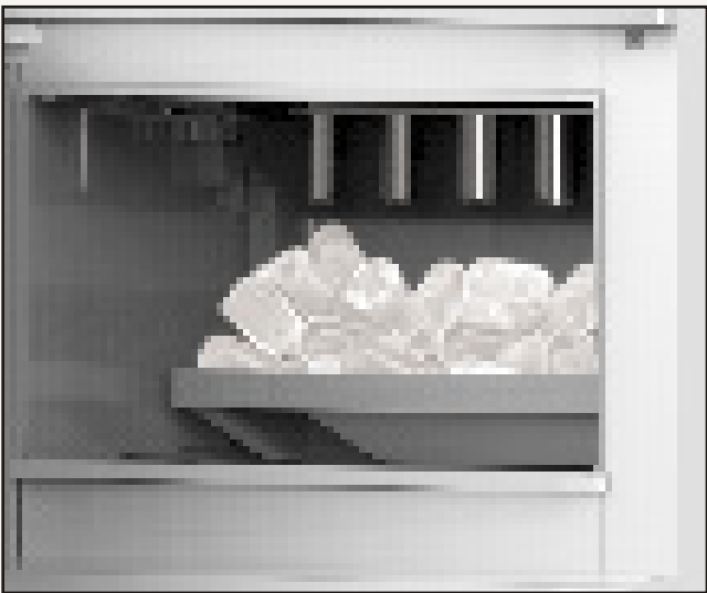
Bullet Shaped Ice