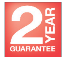
2 year warranty