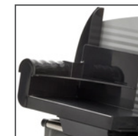
blade safety guard