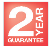
2 year warranty