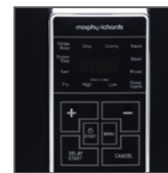
digital control panel featuring 10 preset functions