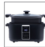
one pot cooking