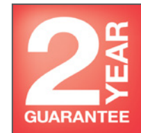
2 year warranty

Stylish traditional design combining all the features required in today's modern kitchen